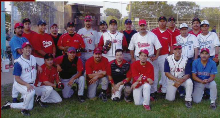
La Liga Latina de Baseball de Madison