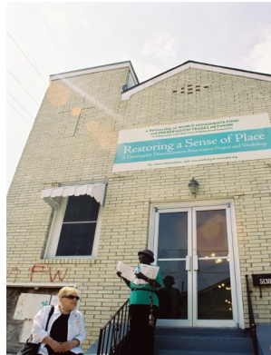
Holy Cross Neighborhood Association