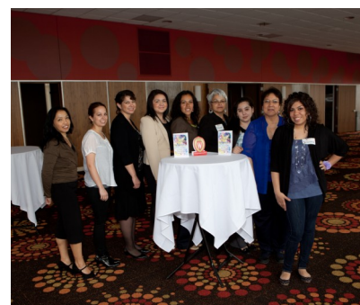
LML Planning Committee Members