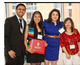
Spring 2010 Graduation Ceremony

The Chican@ & Latin@ Studies (CLS) Program at UW-Madison welcomes donations from alumni, friends, supporters, and organizations. The gifts and donations contribute to the enrichment and quality of the program and benefit the educational experiences of students and members of the community. Your contribution will support multiple aspects of CLS, including a scholarship program for students enrolled in our certificate program, workshops, and study groups. With your support, CLS is able to continue its support of the academic, service-oriented, and culturally enriching activities students are involved in via the Chican@ & Latin@ Certificate Student Association (ChiLaCSA) and the CLS speaker-series.