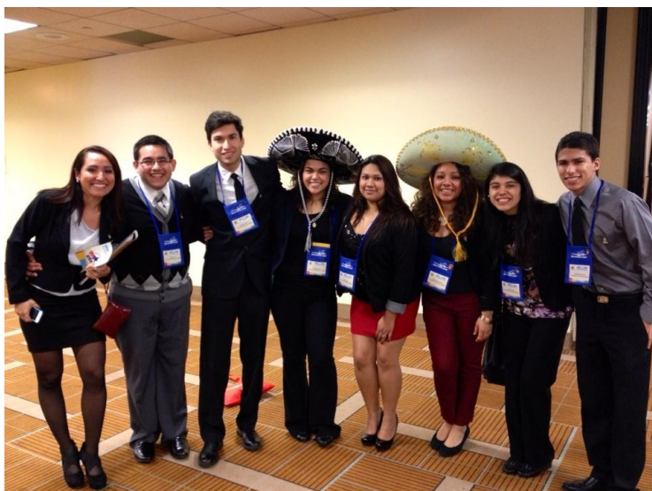
Chican@ & Latin@ Studies Certificate Students at the 2013 USHLI Conference in Chicago, IL