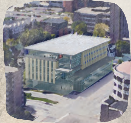
Proposed building for the CLS relocation happening in 2025.